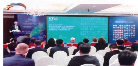
International high-end forum